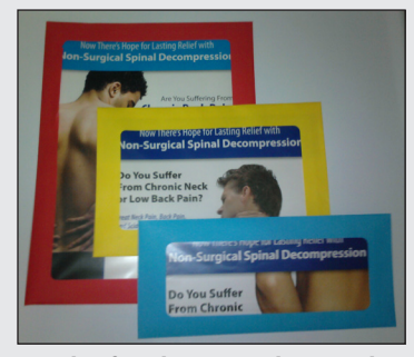
Example of mailers in window envelopes (envelopes available at www.uline.com)