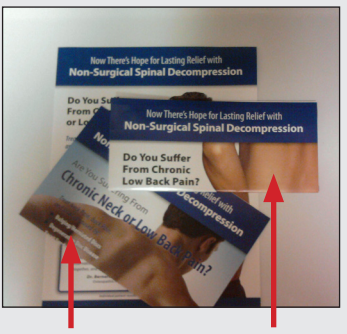
Folded in half Folded in thirds